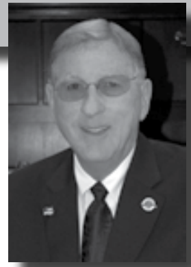
Charles W. "Sonny" Penhale Mayor of Helena