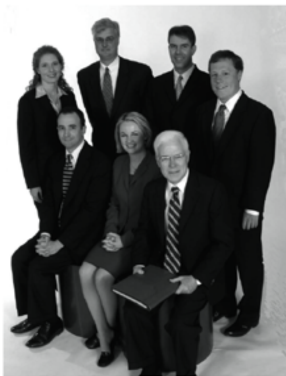
MUNICIPAL AND PUBLIC FINANCE GROUP

In accordance with the Alabama State Bar requirements, no representation is made that the quality of the legal services to be performed is greater than the quality of legal services provided by other lawyers.